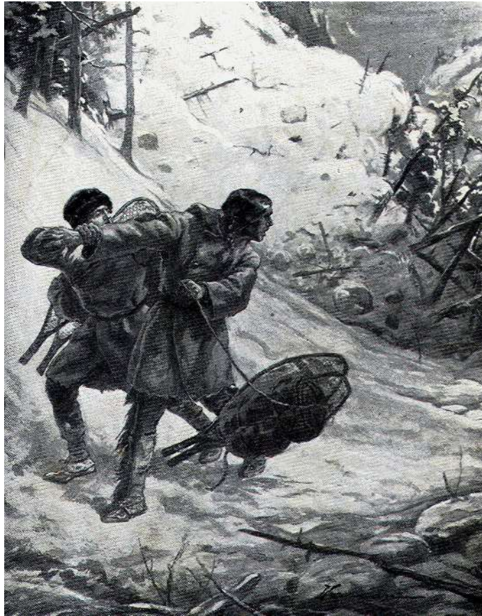
THE AVALANCHE BURST INTO THE FLAT.

Re-slinging our packs, we climbed the rough mass of the slide, round and over big boulders, ice blocks, and tree trunks, through piles of brush and broken branches. At the apex of the heap Pitamakan reached down, pulled something from the earth-stained snow, and passed it to me. It was the head and neck of a mountain goat, crushed almost flat, the flesh of which was still warm.