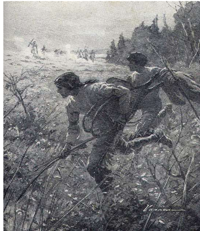
I GRABBED THEM UP AND FOLLOWED HIM.

webbing sagged under our feet. At the edge of the prairie the timber was scattering; but back a short distance there were several dense thickets, and back of them again was the line of the heavy pine forest. We made for the nearest thicket, while the yells of the enemy sounded nearer and louder at every step we took.