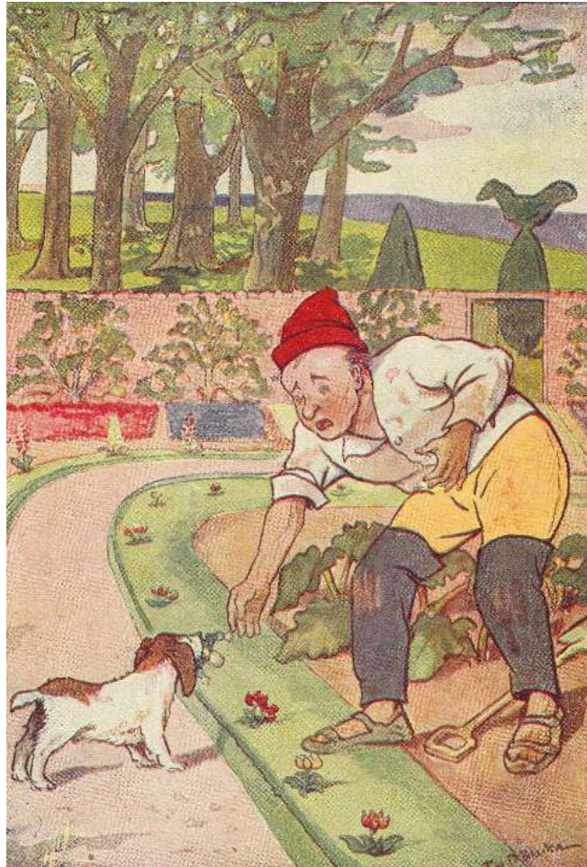
THE DOG CARRIED GULLIVER TO ITS MASTER.

One day, however, with a thick stick he made a good shot at a linnet, and knocked it over. Rushing up, he seized it round the neck and dragged it off in triumph to Glumdalclitch.