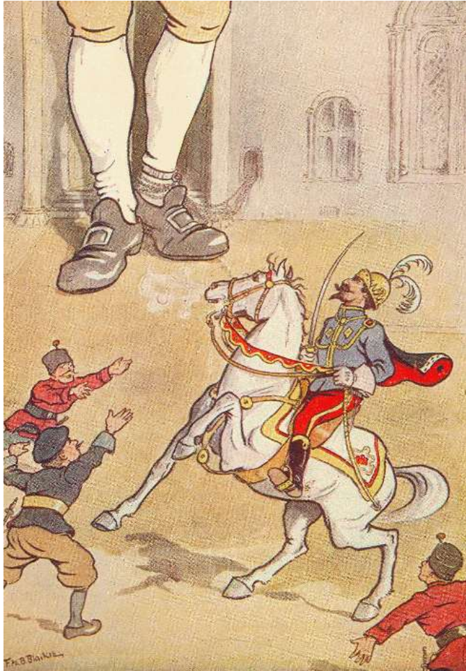
SEVERAL OF THE KING'S GUARDS RAN IN TO SEIZE THE HORSE BY THE HEAD.