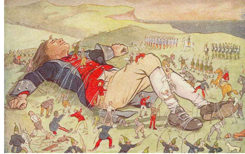
HIS ARMS AND LEGS WERE TIGHTLY FASTENED TO THE GROUND.

greatly that now he lay on a sort of platform. How had he got there?