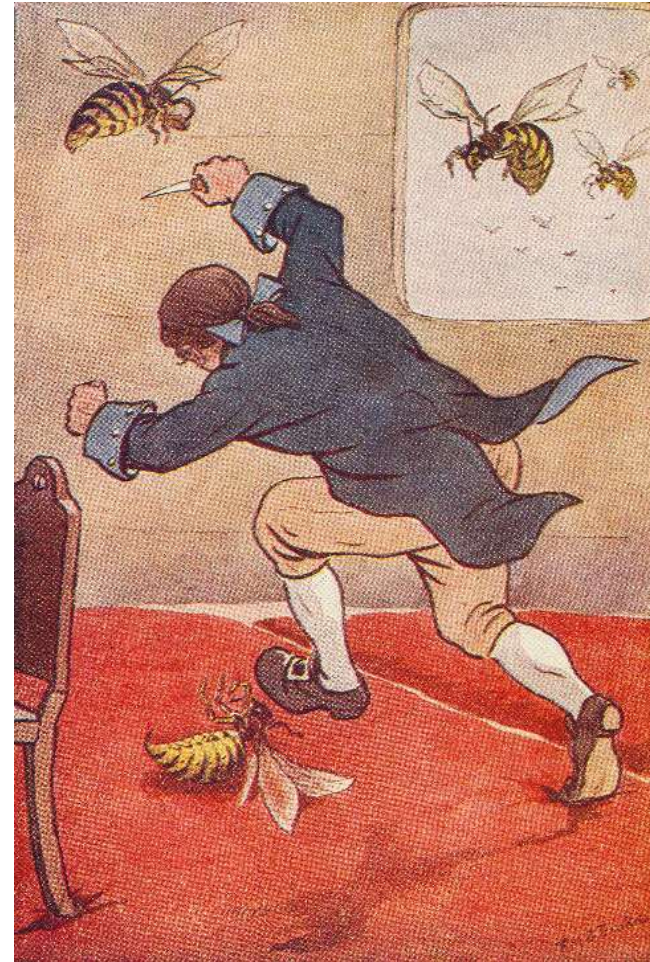
FOUR DEAD WASPS HE CUT DOWN AND STAMPED ON TILL THEY WERE DEAD.

vessels from ever coming nearer this land than Gulliver's ship had come.