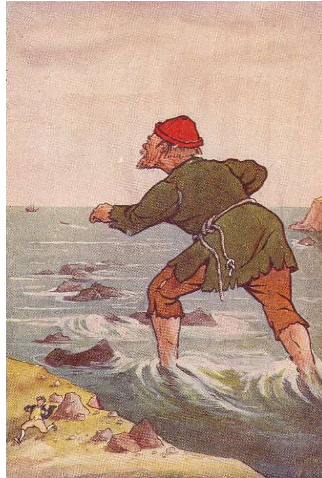
WADING THROUGH THE WAVES WAS AN ENORMOUS MAN.

but always gaining on the boat, was an enormous man, bigger even than a giant in a fairy tale.