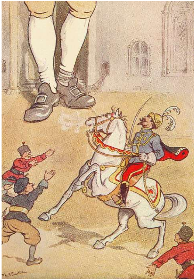
SEVERAL OF THE KING'S GUARDS RAN IN TO SEIZE THE HORSE BY THE HEAD.

One of the sports of which they were most fond was rope dancing, and there was no more certain means of being promoted to high office and power in the state than to possess great cleverness in that art. Indeed, it was said that the Lord High Treasurer had gained and kept his post chiefly through his great skill in turning somersaults on the tight rope. The Chief Secretary for private affairs ran him very close, and there was hardly a Minister of State who did not owe his