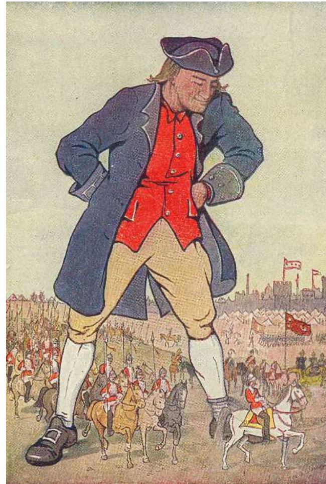
THE TROOPS MARCHED THROUGH THE GREAT ARCH MADE BY HIS LEGS.

to his left leg, and all the while Gulliver dared not move a hairsbreadth, lest he should injure some of the soldiers.