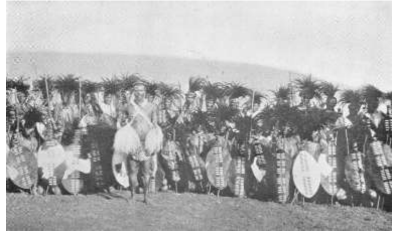
A BAND OF ZULU WARRIORS IN WAR COSTUME.

determined to drive all the white settlers out of the country. A large "impi," or war party, was despatched to attack and exterminate the remaining whites in their camps on the Tugela and Bushmans Rivers. These latter, while anxiously awaiting Retief's return, were in no fear of hostilities, and the men for the most part were absent from their camps on hunting trips.