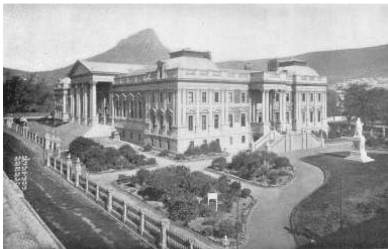
CAPE COLONY GOVERNMENT HOUSE, AT CAPE TOWN.

and that all the wars have retarded the natural growth and development of the colonies to an aggregate of twenty-five years. In this estimate is not included the great harm to industries that has been caused by the score or more of heavy war clouds with which the country has been darkened during the last half century. These being some of the difficulties with which the two British colonies in South Africa are beset, it can be readily inferred to what extent the Boers of the Transvaal have had cause for grievance. In their dealings with the Boers the British have invariably assumed the role of aristocrats, and have looked upon and treated the "trekkers" as sans-culottes .