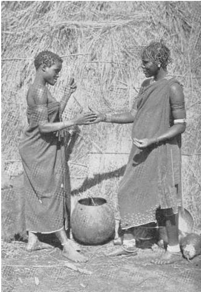
ZULU MAIDENS SHAKING HANDS.

an undulating plain and towns with far less interest in their appearance than in their names. The traveller surfeited with Natal scenery finds amusement and diversion in the conductor's call of Umbilo, Umkomaas, Umgeni, Amanzimtoti, Isipingo, Mooi River, Zwartkop, or Pietermaritzburg, but will not attempt to learn the proper pronunciation of the names unless he has weeks at his command.