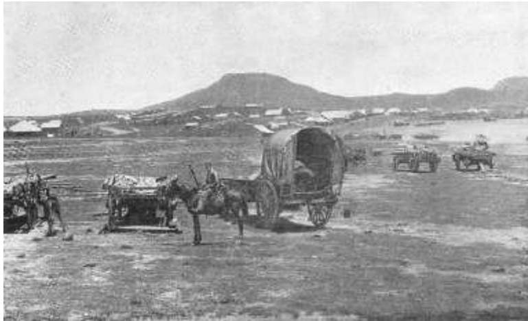
MAJUBA HILL, WHERE ONE HUNDRED AND FIFTY BOER VOLUNTEERS DEFEATED SIX HUNDRED BRITISH SOLDIERS.

tub whose summit could only be reached by a narrow path. General Colley and six hundred men, almost all of whom were trained soldiers fresh from England, ascended the narrow path by moonlight, and when the sun rose in the morning were able to look from the summit of the hill and see the Boer camp in the valley.