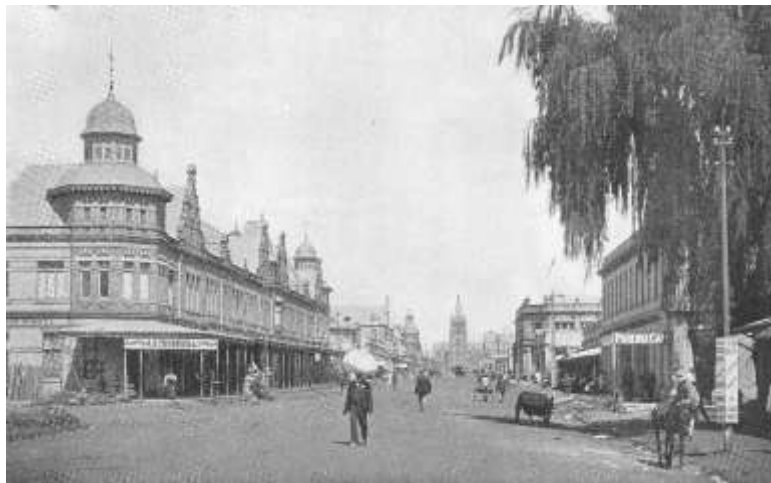
KIRK STREET, PRETORIA, WITH THE STATE CHURCH IN THE DISTANCE.

The religion of the Boers is one of their greatest characteristics, and one that can hardly be understood when it is taken into consideration that they have been separated for almost two hundred years from the refining influences of a higher civilization. The simple faith in a Supreme Being, which the original emigrants from Europe carried to South Africa, has been handed down from one generation to another, and in two centuries of fighting, trekking, and ranching has lost none of its pristine depth and fervour.