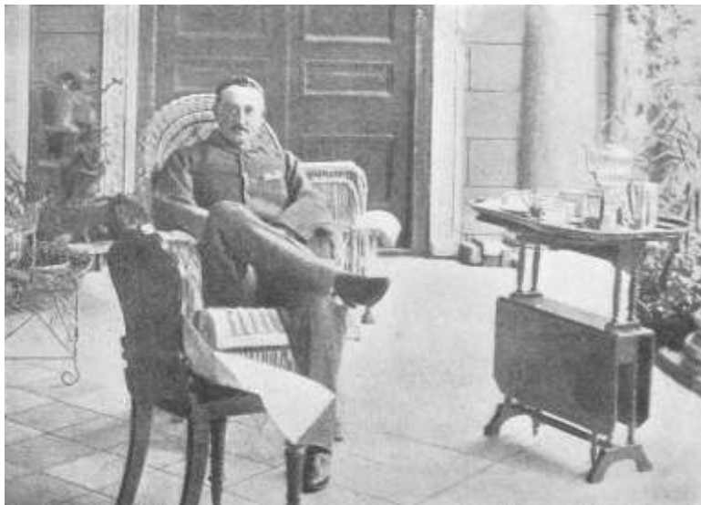
THE RT. HON. CECIL J. RHODES ON THE PIAZZA OF HIS RESIDENCE, GROOTE SCHUUR, AT RONDEBOSCH, NEAR CAPE TOWN.

safely, but with little or no money. The boys were energetic, and found opportunities for making money where others could see none.