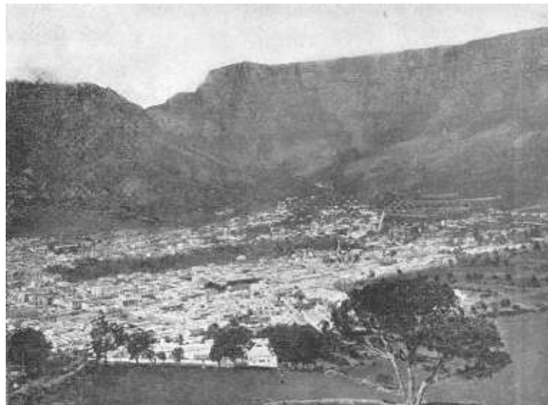
CAPE TOWN AND TABLE MOUNTAIN.

"If we want an example of the highest type of freedom," said W. P. Schreiner, the present Premier of Cape Colony, "we must look to the United States of America."