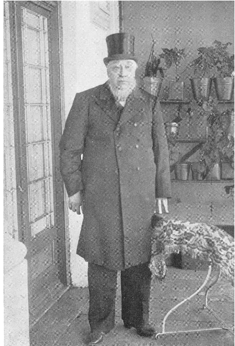
PRESIDENT KRUGER ON THE PIAZZA OF THE EXECUTIVE MANSION, PRETORIA.