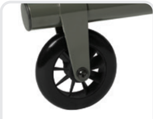
4" (7.6cm) fixed rear casters allow for easy access and keep the tray secure