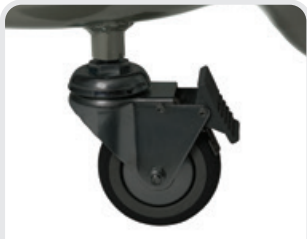
3" (10cm) front swivel casters lock