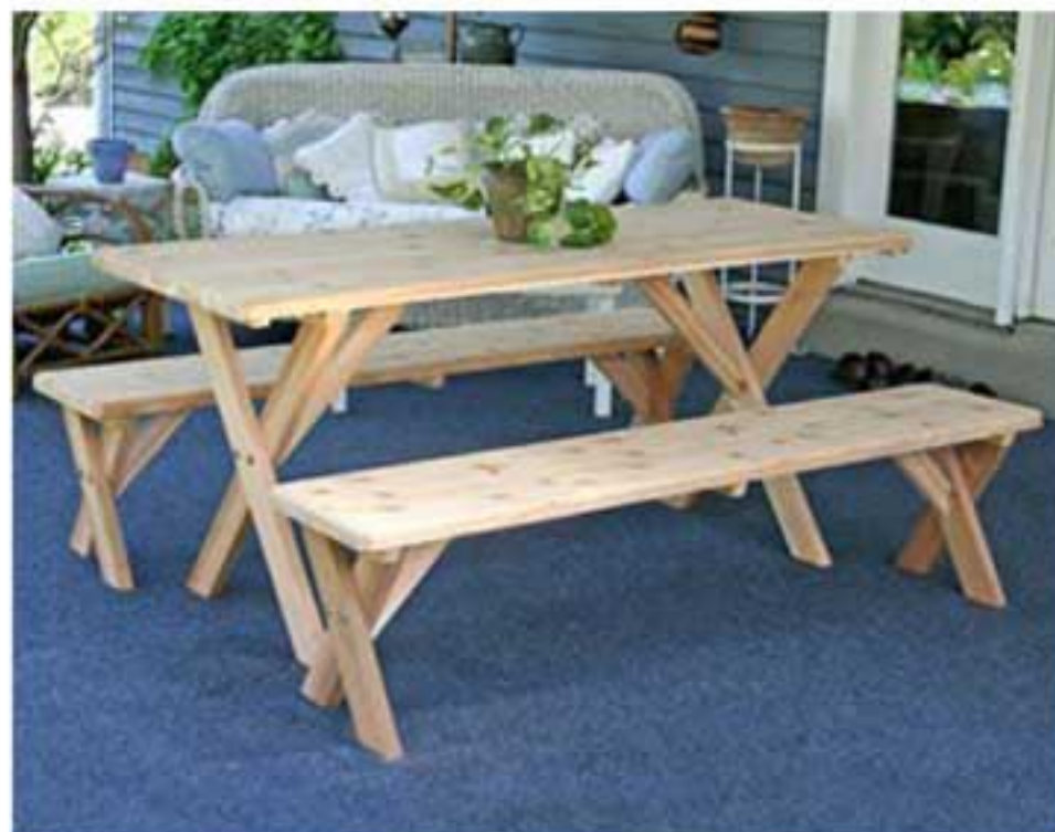
5 Foot Table Shown Above