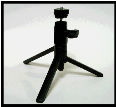
Figure 1: Table Top Tripod (standing)

Table Top Tripod (P/N 90050) - Collapsible table tripod for mounting the viewer, camera, or other equipment which has the 1/4-20 threaded mounting socket.