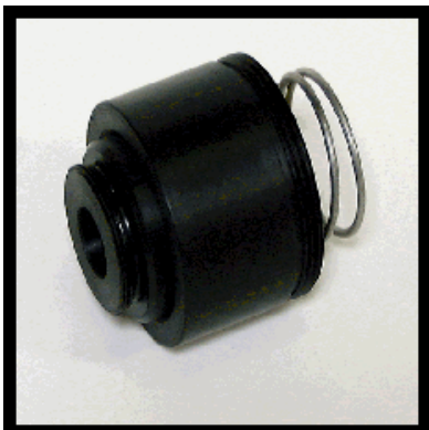
Figure 4: Relay Assembly

This is done by simply removing the eyepiece from the viewer and installing the relay in the viewer and attaching a CCD camera to the relay.