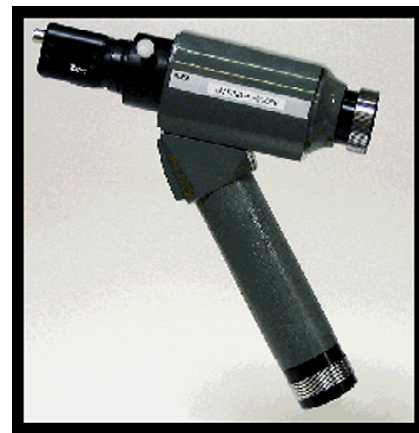
Figure 3: CCD Camera mounted on the UV Scope