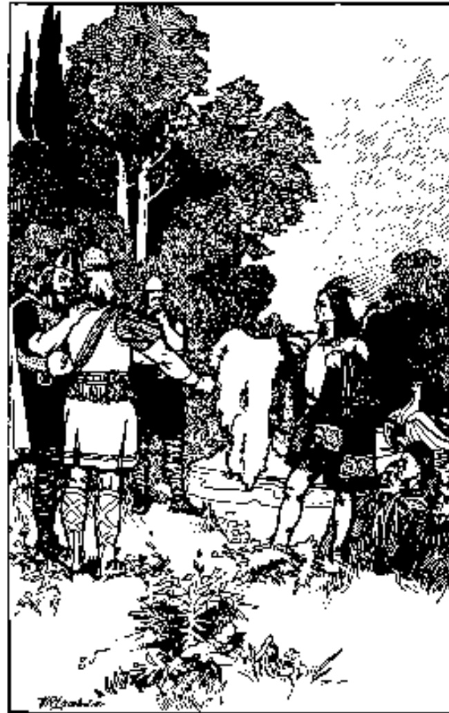
"The chief held them out to Thorfinn and hugged the cloak to him"

"If they want red stuff, I have a whole roll of red cloth that I will trade," one of the other men said.