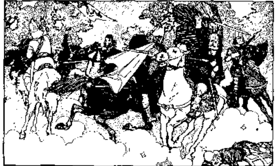
"King Haki fell dead under 'Foe's-fear' "

"Up with the war shield!" shouted King Harald. "Horns blow!"