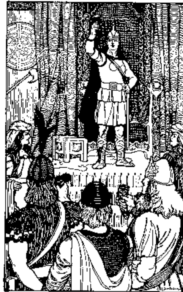
"I vow that I will grind my father's foes under my heel"

"This horn of memory I drink in honor of my father, Halfdan, son of Gudrod, who sits now in Valhalla. And I vow that I will grind my father's foes under my heel."