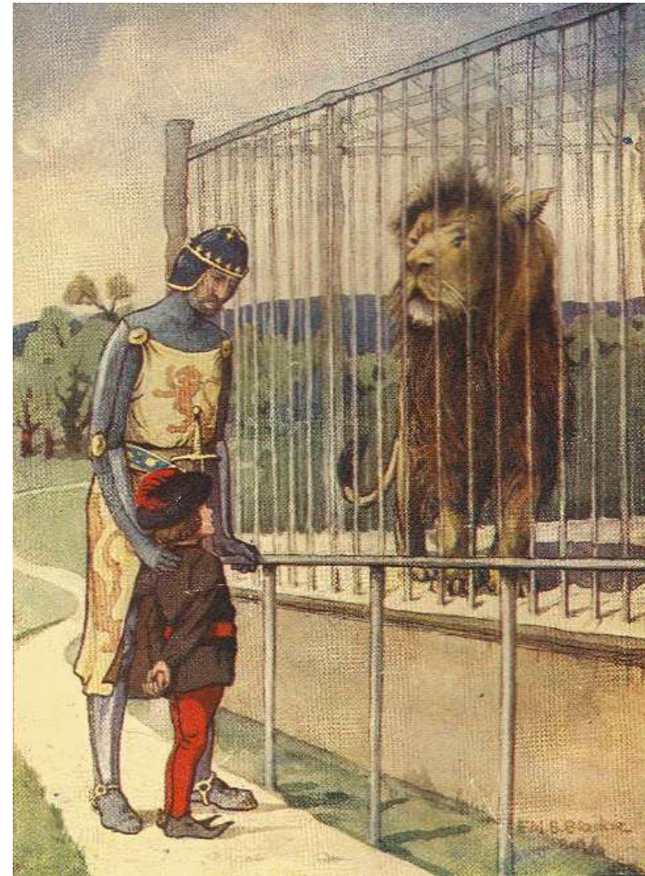
HIS ROYAL PET WAS A LION.

"The Treaty of Northampton," which arranged for this marriage, gained every point for which Bruce had striven so long. In the same year the Pope removed his sentence of excommunication, and the King of England no longer wrote of "the rebel, Robert de Brus, lately Earl of Carrick." He was now, in letters from Edward III., "the magnificent Prince Sir Robert, by the grace of God, King of Scots, his dearest friend."