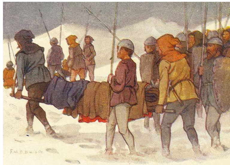
SLOWLY, WITH THE KING'S LITTER IN THE CENTRE OF A COLUMN, THE MARCH WAS MADE.

"That is true," said the Douglas. "On my way here I passed close to a company of 200 of them, bivouacked so carelessly on Raploch Moss that a surprise will be very easy."