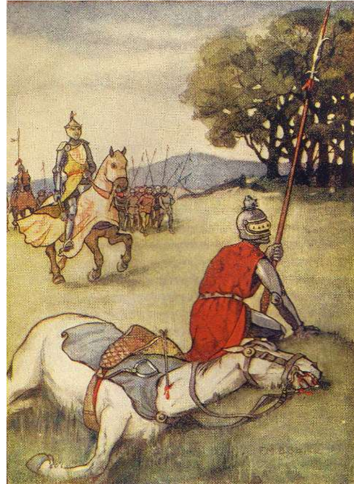
THE YOUNG KNIGHT'S HORSE FELL TO THE GROUND.

him at the end of his last battle with the huge body of the giant who, in dying, he had killed, lying across him. His body was hewn in pieces and his limbs were stuck on the walls of Irish towns held by the English.