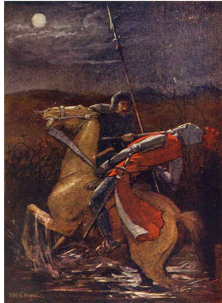
A DRIVE FROM THE BRUCE'S SPEAR MADE THE RIDER FALL BACK DEAD.

Bruce then woke his two men. With them he crossed the stream, and sent them on to alarm the others, and make them flee onwards.