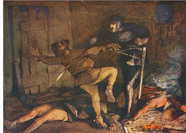
ONE AFTER ANOTHER THE MURDERERS FELL BEFORE HIS SWORD.

An old woman lived in a cottage on the hill. She had been three times married, and by each husband had a son. Their names were Murdoch, MacKie, and MacLurg. It was not yet dawn when the Bruce arrived, but the woman met him fearlessly.