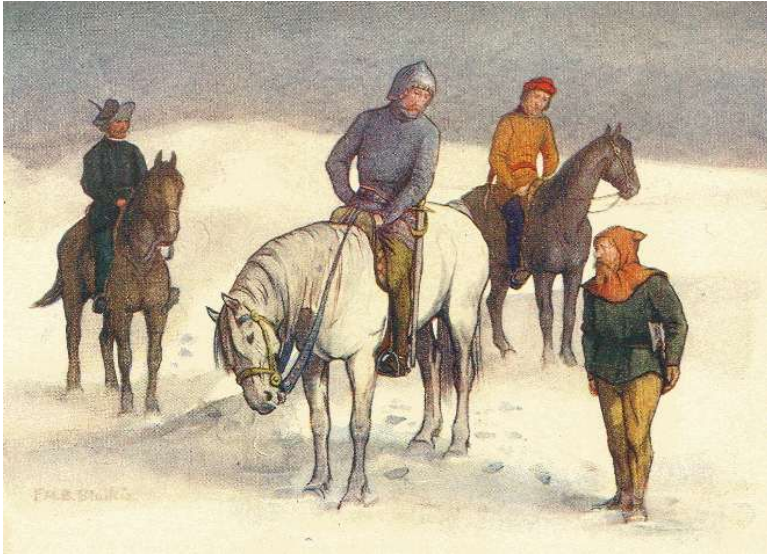
THE MAN BEGAN TO TELL LYING TALES.

But, however they may have been shod, the horses did their journey well. In fifteen days from the start they were safely over the Border.