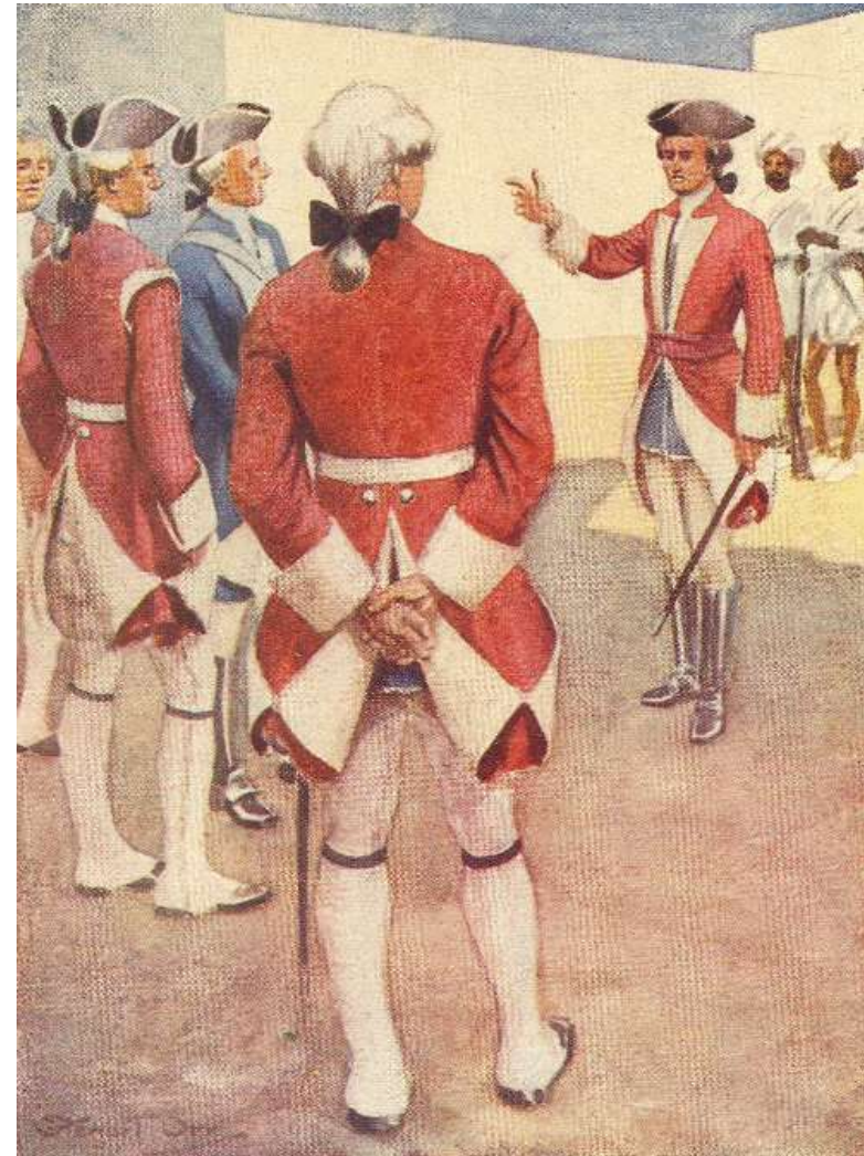
ONE OF THE WORST THINGS CLIVE HAD TO HANDLE WAS A MUTINY AMONGST THE OFFICERS.