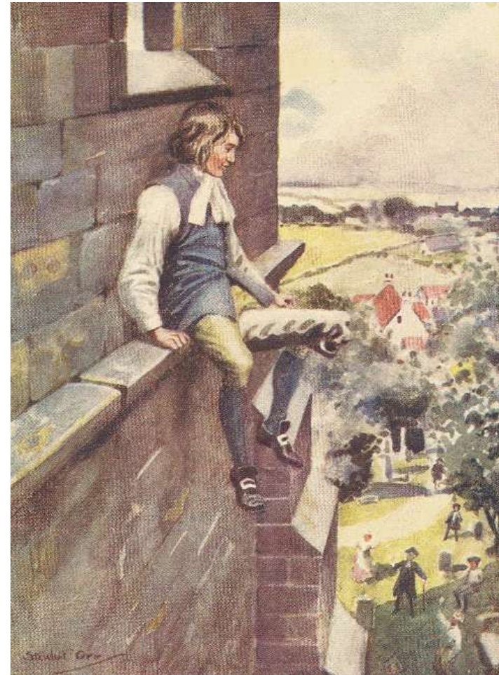
THERE HE SAT, PERFECTLY HAPPY AND FEARLESS.

down you must look down, in order to see where your feet are to go, and to look down causes most people to become dizzy. Then people lose their heads, and sometimes can go no farther, either up or down. They clutch tightly till their hands become cramped, and then, if no help is possible, their grip loosens and they fall.