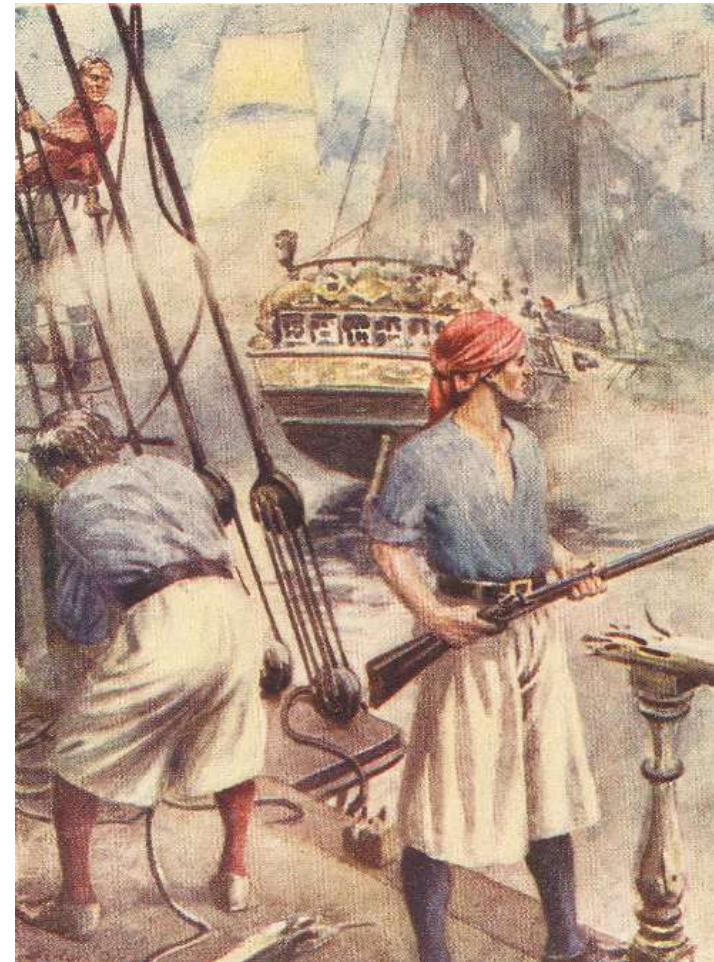
THE DUKE OF DORSET FIGHTING THE DUTCH FLEET IN THE HOOGLY.