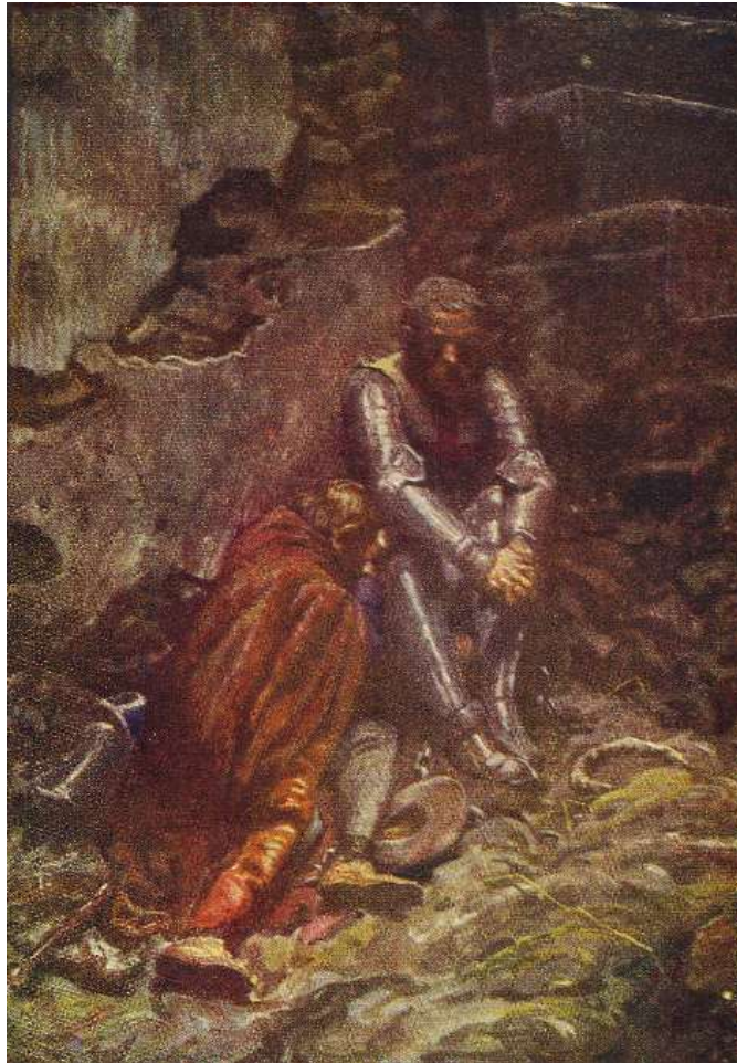
THE OWNER OF THE CASTLE WAS GIANT DESPAIR.

Now it began to rain and thunder and lighten in a very dreadful manner, and the river flowed over the banks.