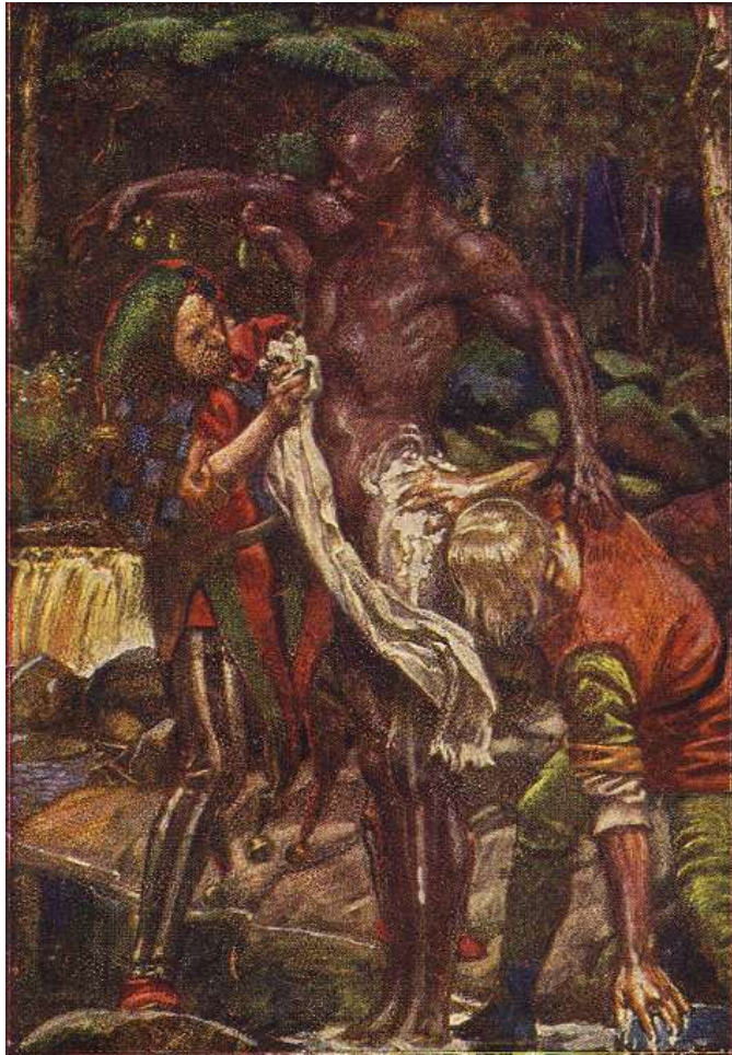
THEY SAW ONE MAN CALLED FOOL, AND ANOTHER CALLED WANT-WIT, WASHING A MAN WHO CAME FROM A COUNTRY WHERE ALL MEN ARE BLACK.

Next the Shepherds took them to Mount Charity. There they showed them a man that had a bundle of cloth lying before him, out of which he cut coats and garments for the poor, yet his bundle of cloth was never smaller.