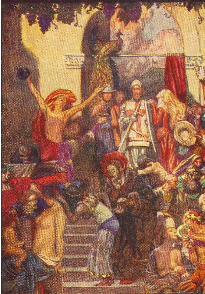
AT THE TOWN THERE WAS A FAIR KEPT, CALLED VANITY FAIR.

And when he overtook Faithful they went very lovingly on together, and talked of all that had happened to them in their pilgrimage.