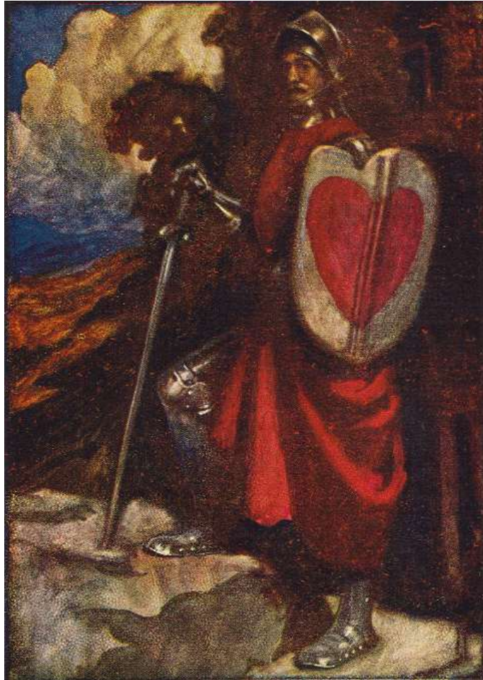
THE INTERPRETER THEN CALLED FOR A MANSERVANT OF HIS, NAMED GREATHEART.

"Guide these pilgrims," said he, "and bring them to the palace Beautiful, at which place they rest next." So he took his weapons and went before them, and the Interpreter said "God-speed."