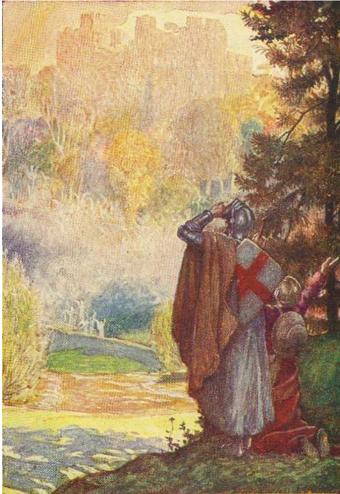
THEY WERE WITHIN SIGHT OF THE CITY TO WHICH THEY WENT.

So I saw that as they went on, there met them two men in raiment that shone like gold, also their faces shone as the light.