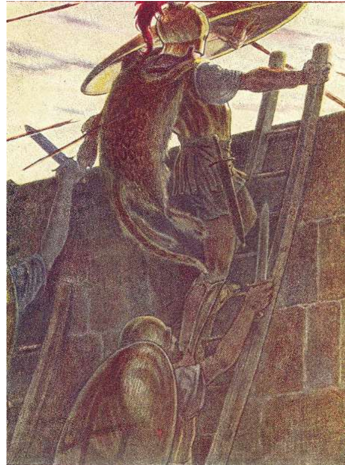
ALEXANDER SCALES THE WALLS WITH THREE MEN

were then in the Punjaub, in India, and though the King coaxed them and scolded them in turn, they would not move. "There they stood," as the old historian says, "looking hard at the ground, and with tears trickling down their cheeks" (so sorry were they to say their King 'nay'). "And so the King, at last, conquered by his soldiers, made up his mind to turn towards home."