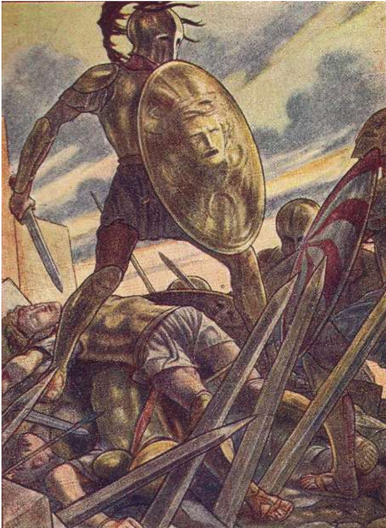
PELOPIDAS AND EPIMANONDAS

country, and the truest friend ever a man might wish to know. He never forgot that he owed his life to Epaminondas. And in Epaminondas he found a friend true as steel, loyal and generous as himself, though they were unlike in many ways.