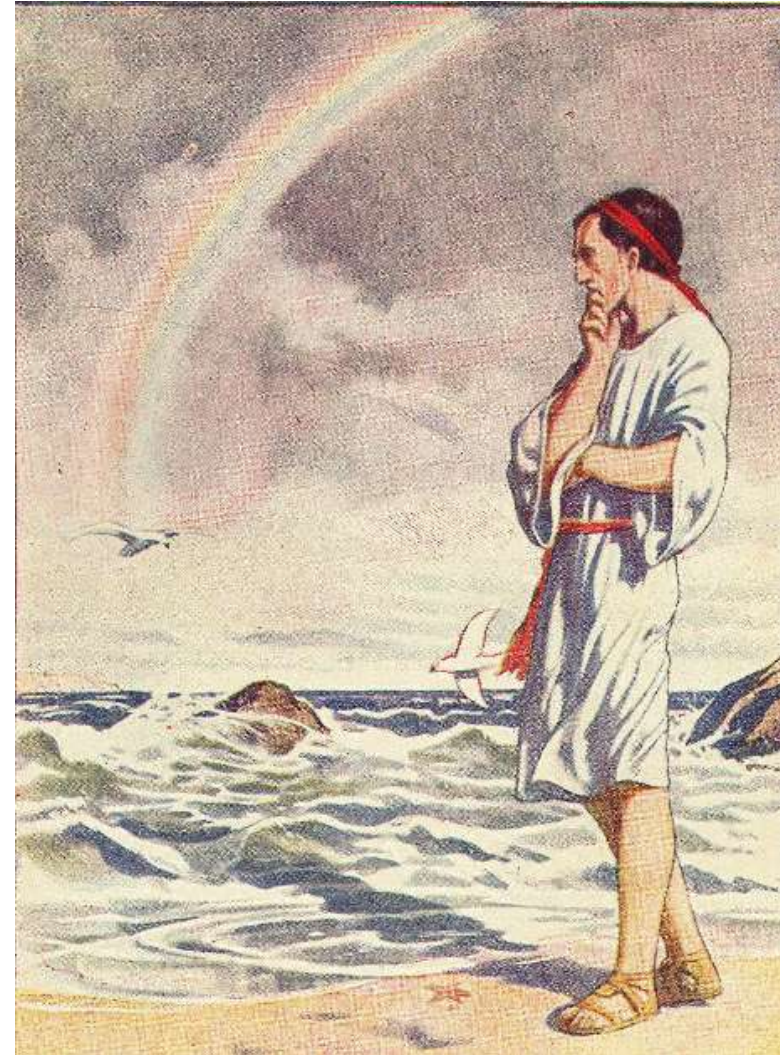
DEMOSTHENES IN EXILE

sure of what really happened. Of one thing we are sure—that Demosthenes did not want, nor use, the money for himself. He wished the city to be rich enough to fight King Alexander again some day, and thought it fair to take Alexander's money to use in that way. For then, as now, men believed that "All's fair in love and war."