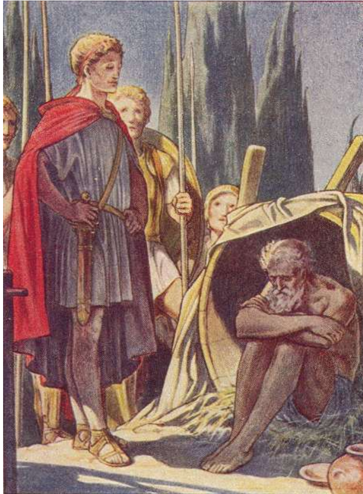
ALEXANDER AND DIOGENES

In the winter he reached Gordium, in which town there was a very old chariot. About this chariot a very interesting story is told.