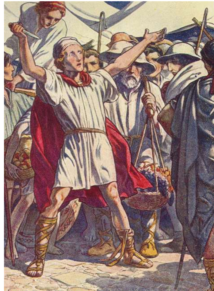
SOLON IN THE MARKET-PLACE

And after that, though he still wrote poetry, it was more serious poetry than before, for he went about among the people, and saw many sad things happening.