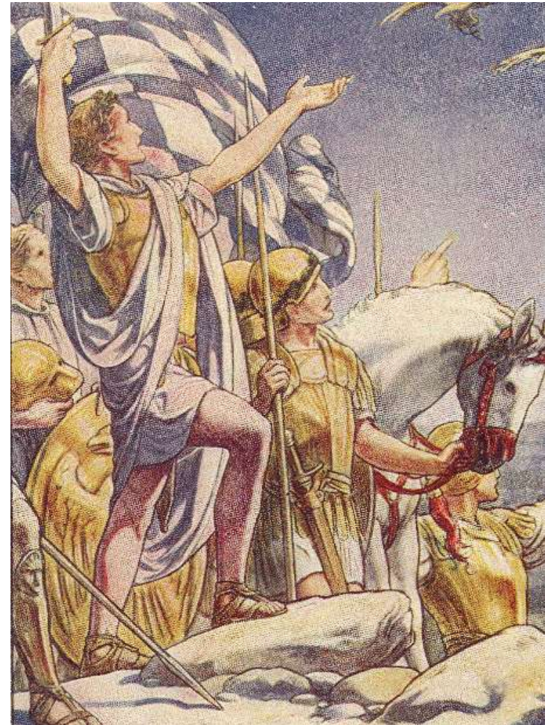
TIMOLEON AND THE EAGLES

ran away in fright, crying out that Timoleon must be mad to think of fighting against seventy thousand men with but six thousand.