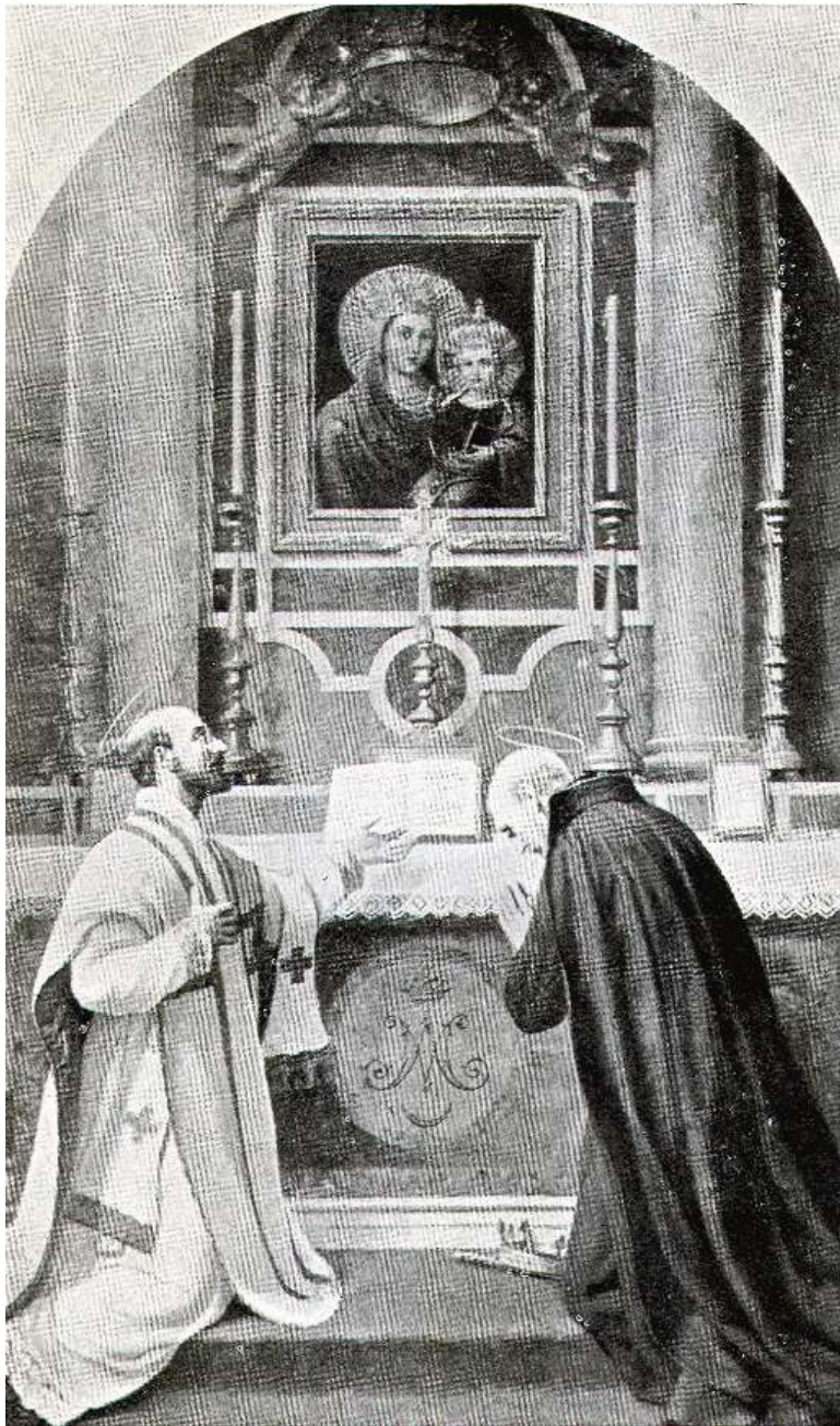
ST. IGNATIUS AND ST. FRANCIS BORGIA BEFORE THE ALTER OF STA. MARIA DELLA STRADA.

"But," said Ignatius, "you are accustomed to play for money, and I have none; I will therefore make a proposal. If you win I will be your servant for a month; if I beat you, you will be at my disposition for the same time, and I promise that it will be for your advantage."