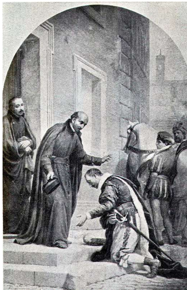
ST. IGNATIUS GREETING ST. FRANCIS BORGIA ON HIS ARRIVAL IN ROME.

Permission to use Heritage History documents or images for commercial purposes, or more information about our collection of traditional history resources can be obtained by contacting us at Infodesk@heritage-history.com