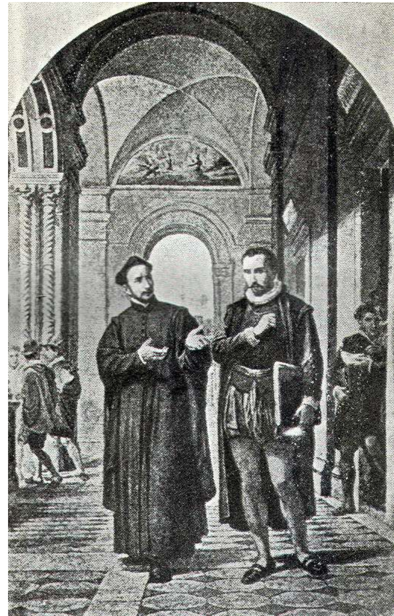
ST. IGNATIUS AND ST. FRANCIS XAVIER AT THE UNIVERSITY OF PARIS.