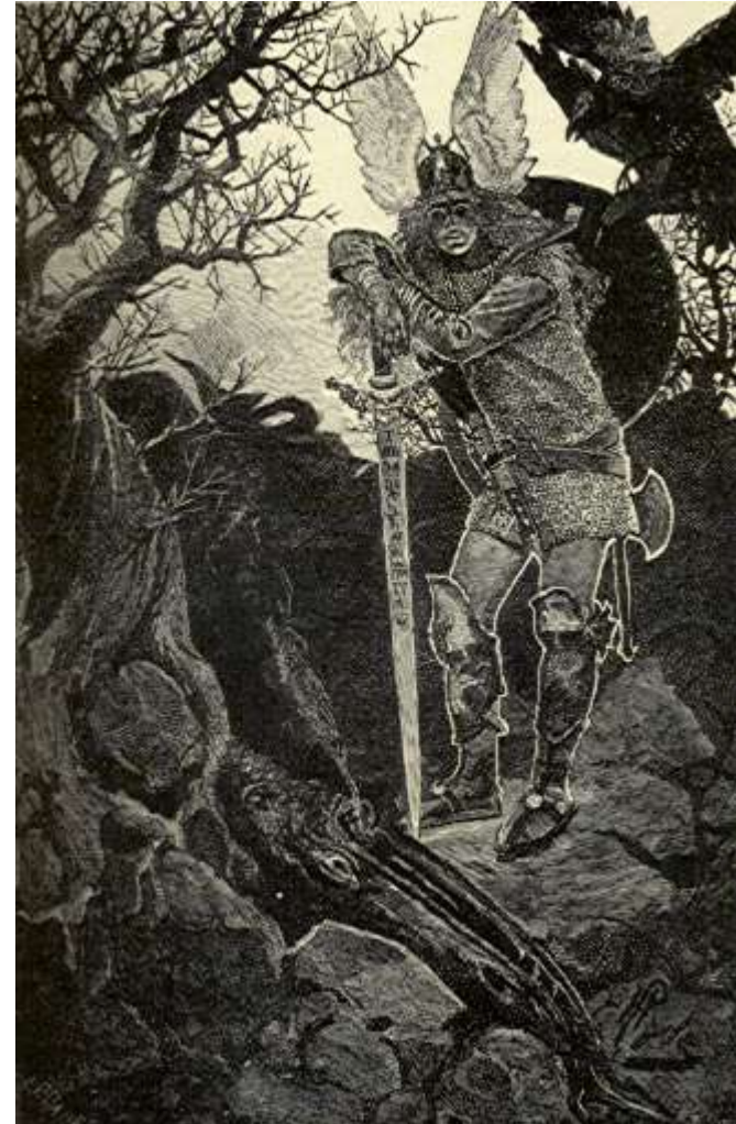
THE DEATH OF FAFNIR

"What man are you who dares come into this land of loneliness and fear?"