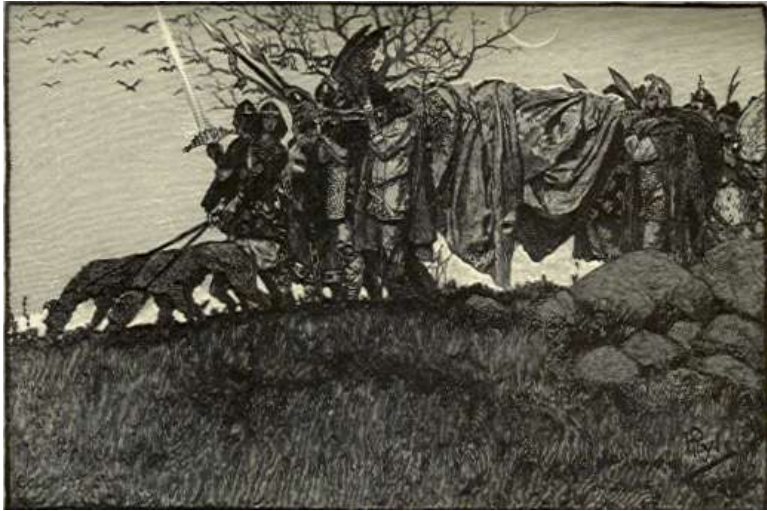
THE DEATH OF SIEGFRIED

"Cowards and traitors, ye! A curse shall fall upon you. My every care has been to serve and please you, and thus I am requited. Bitterly shall you rue this deed. The brand of traitor is set upon your foreheads, and it shall be a mark of loathing and shame to you forever."