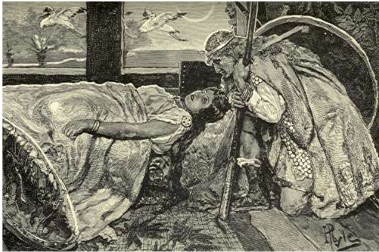
THE AWAKENING OF BRUNHILD

banquet hall clattered their knives and plates, and began again their feast; and their chief dropped his goblet, and rubbed his eyes, and wondered that sleep should have overtaken him in the midst of such a meal.