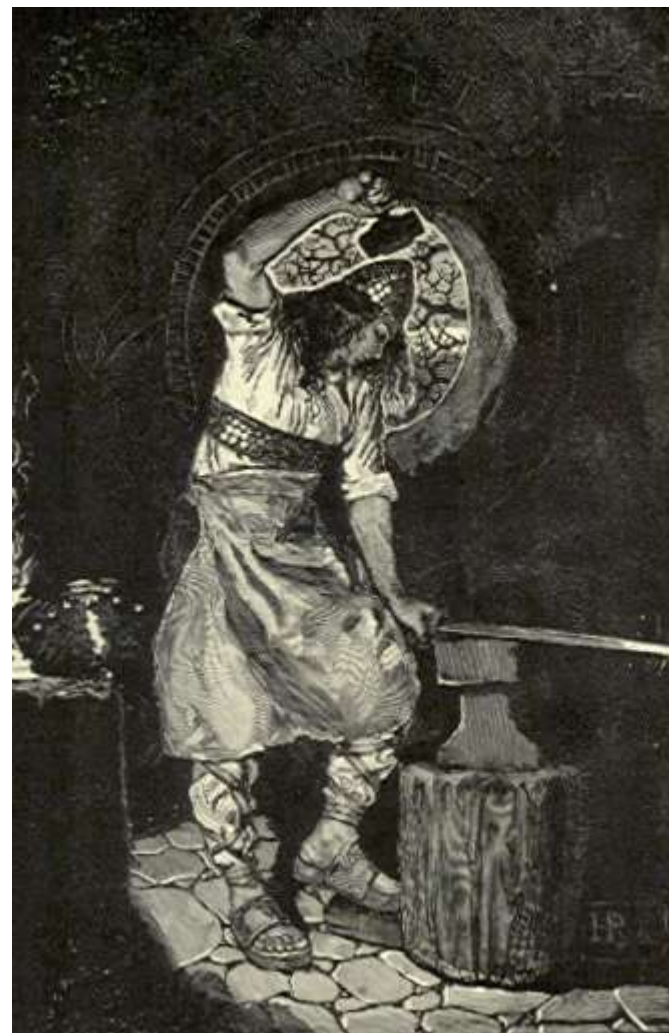
THE FORGING OF BALMUNG