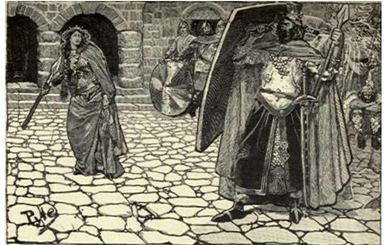
THE TRIAL OF STRENGTH

Hagen's frowning face grew darker, and the uneasy glances which shot from beneath his shaggy eyebrows were not those of fear, but of anger and deep anxiety. Dankwart gave up all as lost, and loudly bewailed their folly.